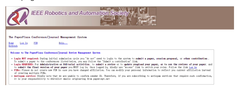
Step 2: scroll down and look for the item "ARSO2016"