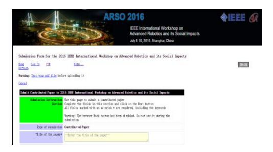
Step 5: Follw the submission wizard to submit your paper.